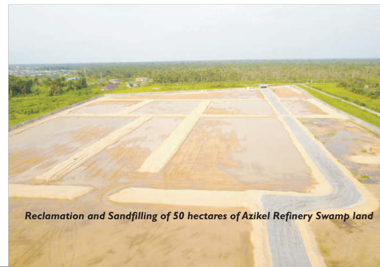
Reclamation and Sandfilling of 50 hectares of Azikel Refinery Swamp land

Azikel Dredging has significantly contribute to the infrastructural development of the Niger Delta and Nigeria. Some of these critical developments are in massive project infrastructure across the nation, like the East west road sandfilling, building of new cities, educational institutions and development in the oil and gas sector.