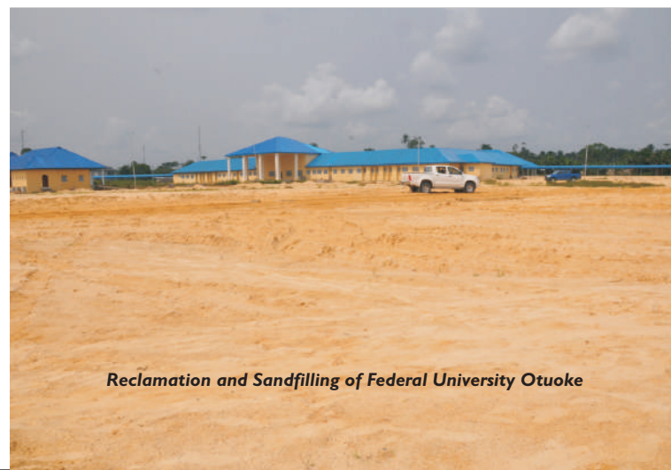
Reclamation and Sandfilling of Federal University Otuoke