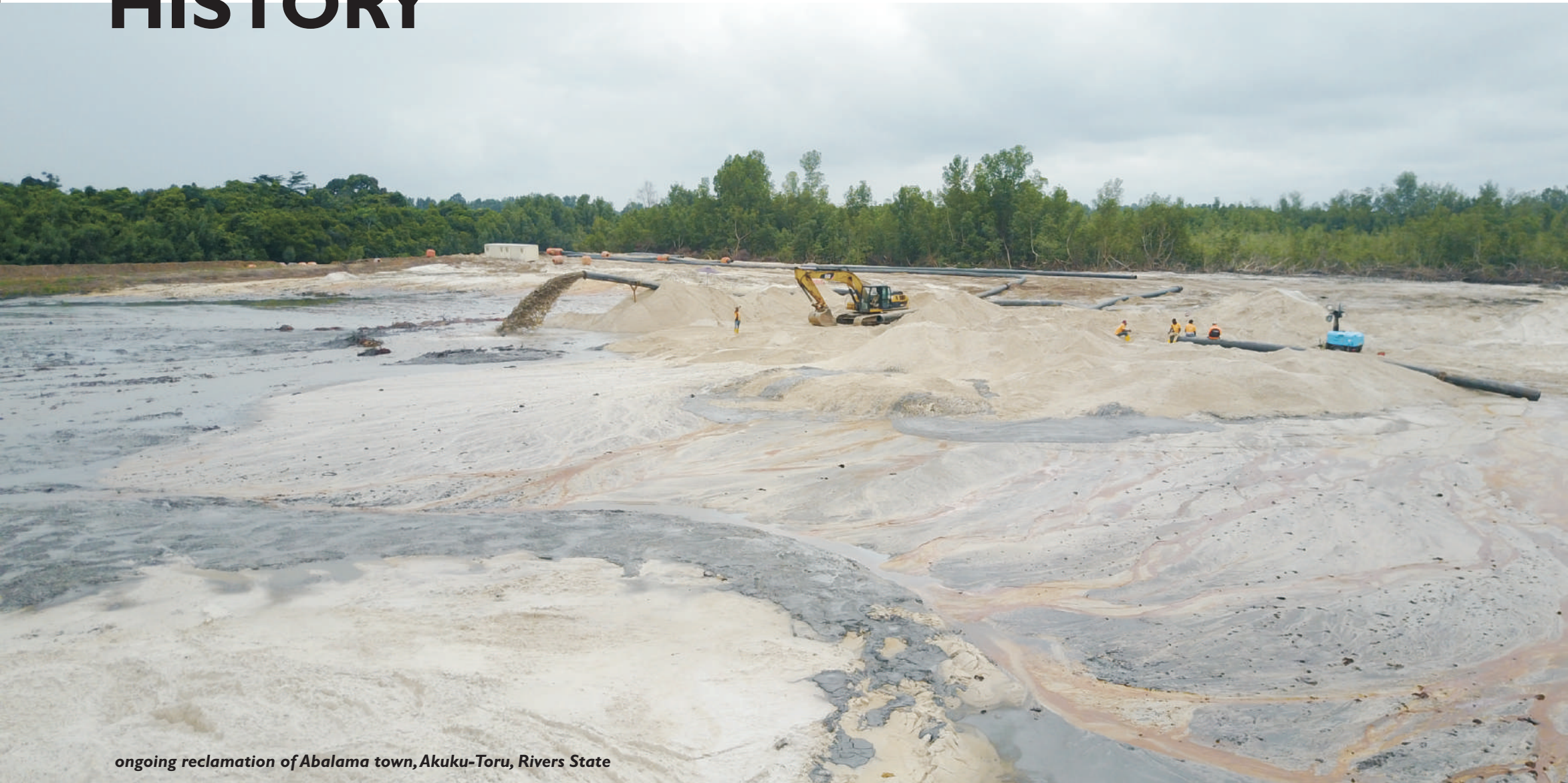
ongoing reclamation of Abalama town, Akuku-Toru, Rivers State